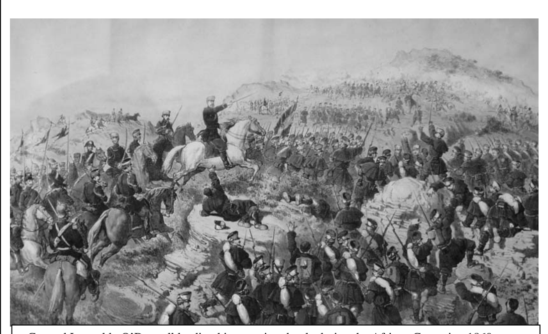
General Leopoldo O'Donnell leading his army into battle during the African Campaign 1860.